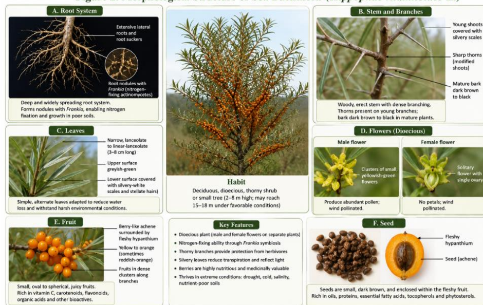
Fig No. – 2 Morphological Structure of Sea Buckthorn